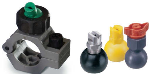
HP-Eyelet assemblies for use with QuickJet ProMax ball body and spray tips, Clip-Eyelet ball-type spray tips or threaded ball and threaded nozzles