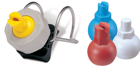
Clip-Eyelet assemblies with Clip-Eyelet ball-type spray tips

See pages 11 to 12 for performance data.