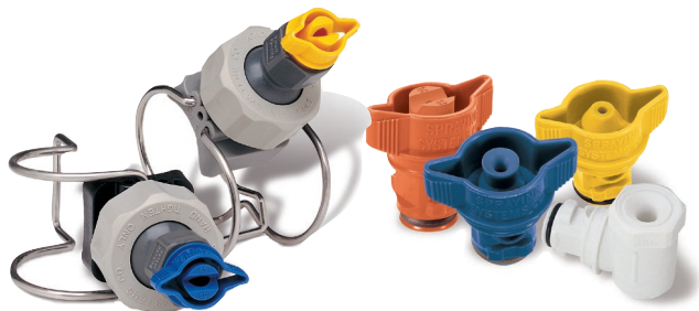
Clip-Eyelet assemblies with ProMax QuickJet ball bodies and spray tips