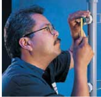
Clean nozzles with a material that is softer than the orifice, like a toothbrush or toothpick.

cleaning rasps. It is very easy to damage the critical orifice shape (or size) and end up with distorted spray patterns or excess flow. If you are faced with a stubborn clogging problem, try soaking the orifice in a non-corrosive cleaning chemical to soften or dissolve the clogging substance.